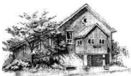
MUSIC AT THE HALL