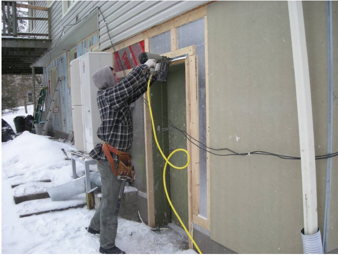
(Now that our Go Green Grant project has ended, a twoonie donation for the Hall is appreciated.)